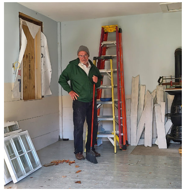
To a man with a broom, everything looks like a mess!