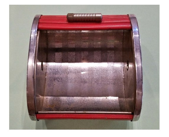
Can you identify this item for us?

We think it's a cigarette case, but we're not sure. Contact Betty Moore 926-2543 if you can help us out.