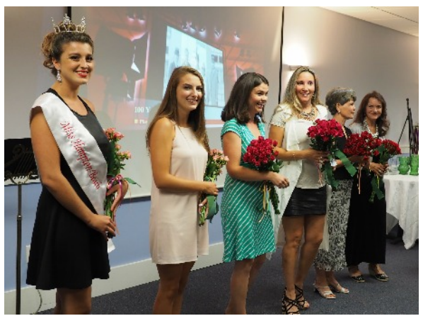
Current and past Miss Hampton Beach