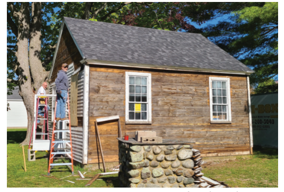
Another picture on p.7