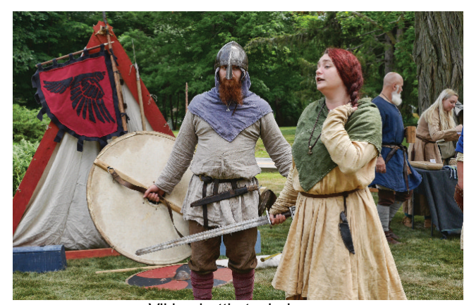
Viking battle techniques

The mission of the Hampton Historical Society is to increase public knowledge and understanding of the history and cultural heritage of the town of Hampton, New Hampshire, from its earliest inhabitants to the present generation. We will communicate that history through an active museum, educational programs, and a resource library.