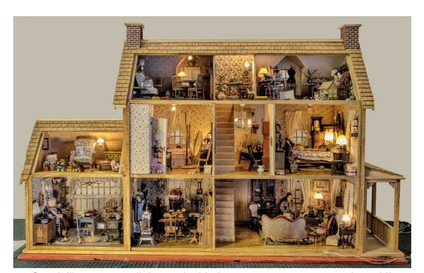
Our dollhouse even lights up inside in most rooms - come and see it!!