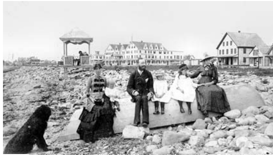
A day at Hampton Beach

farmers and fishermen. The extensive salt marshes were fertile grazing areas for cattle, and fishermen took a rich catch from the cod-laden waters. As the only purely Puritan settlement in New Hampshire, however, Hampton was not immune to the civic and religious struggles of the seventeenth and eighteenth centuries. As in other parts of early New England, accusations of witchcraft brought several local women into court, although no executions ever took place. Political turmoil touched the town several times, particularly during the late 17th century, when local resident Edward Gove led a rebellion against the provincial government and ended up as a prisoner in the Tower of London. Although the town remained small and fairly remote from the growing commercial centers of Portsmouth and