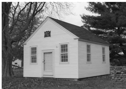
The last of Hampton's 19th century one room schoolhouses was moved to the Green

The aims of the Society (the name was officially changed in 1994) have also become broader. To accomplish its goal of the promotion and preservation of the history and heritage of Hampton, the Society conducts an active educational program of tours and lectures throughout the year.