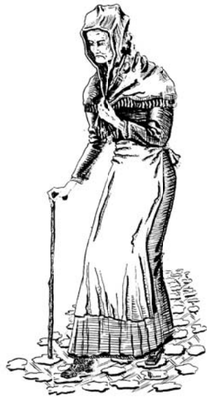
Goodwife Eunice Cole was one of several Hampton women accused of witchcraft 1650-80