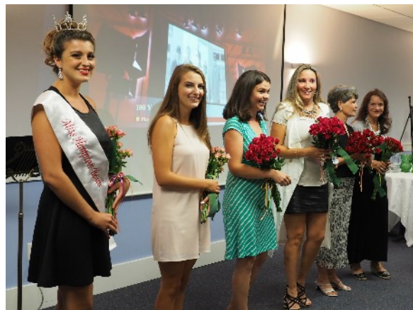
Current and past Miss Hampton Beach