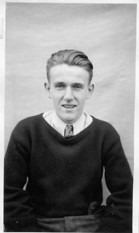
"Still waters run deep."