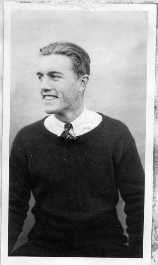
"Energy Wins the Way."

Script Staff: Sports Editor Athletics: Baseball 1, 2, 3, 4 Football 1, 2, 3, 4 Class Marshall Dramatics: Ninth grade and Senior Glee Club 1, 2, 3, 4