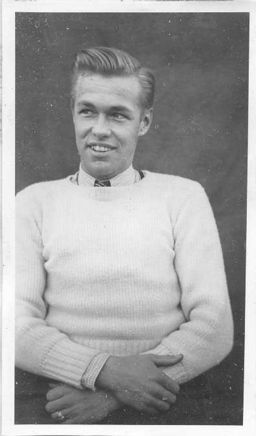
"He who is determined has half his work done."