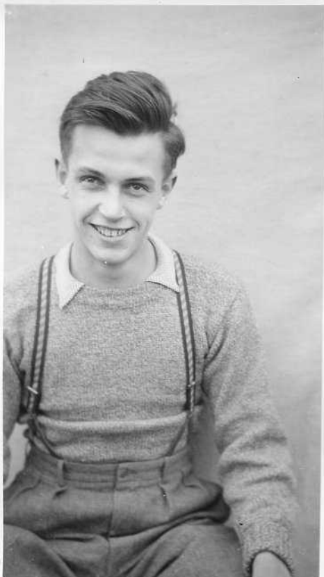
"Large ships need deep water."

Dramatics: Ninth grade and Senior Glee Club: 1, 2, 3, 4 Band and Orchestra