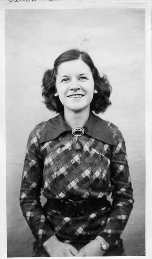
"Life is what you make it"

Athletics: Basketball Volley Ball Softball Glee Club