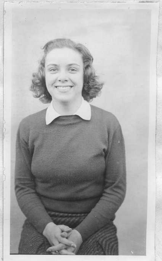
"Brave Hearts are Tender Hearts."

Athletics: Field Hockey--Capt. 1 & 3 Softball-----Capt. 1 & 3 Class President 1 & 3 Band and Orchestra Dramatics: Ninth Grade Script Staff: Asst. Editor Jr. Year Editor--Senior Year.