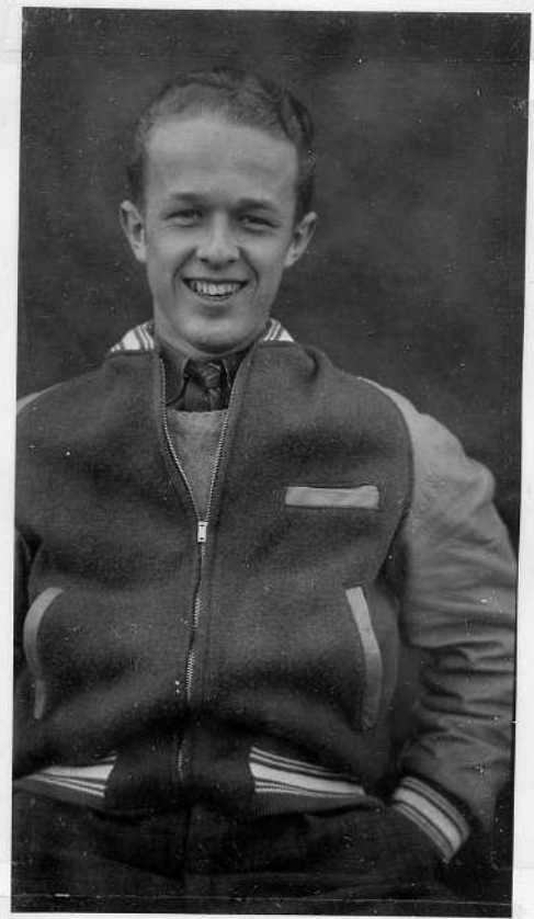
"Better Late than Never"