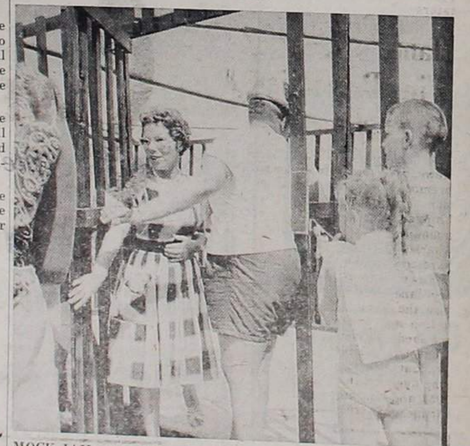
MOCK JAIL was a busy place during Bathing Suit Day last week. Typical scene showing persons entering and leaving the jail set up beside the chamber of commerce office is pictured above. Everyone not in a bathing suit between 1 and 3 p.m. one day last week was put in jail and fined 50 cents. All was in fun!