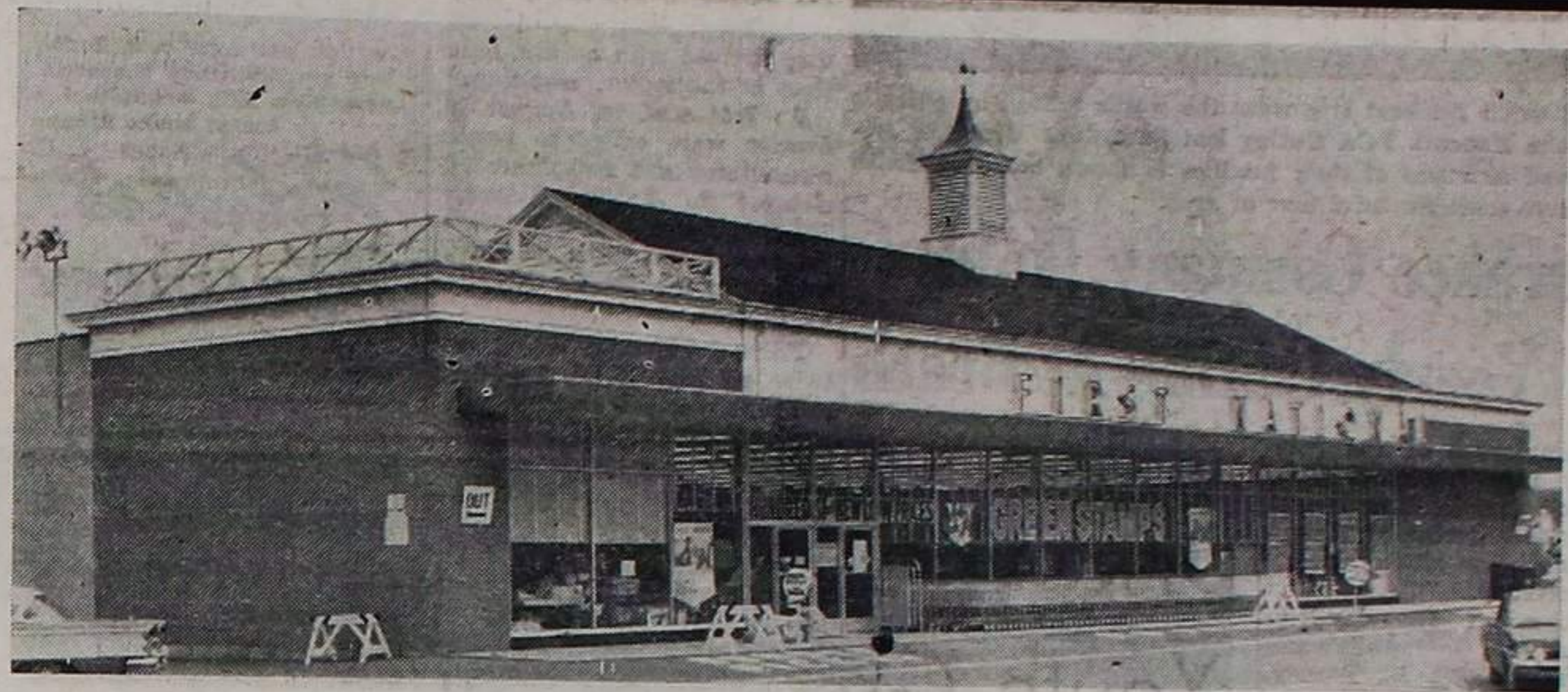
LAFAYETTE ROAD — ADJACENT TO LAMIE'S TAVERN