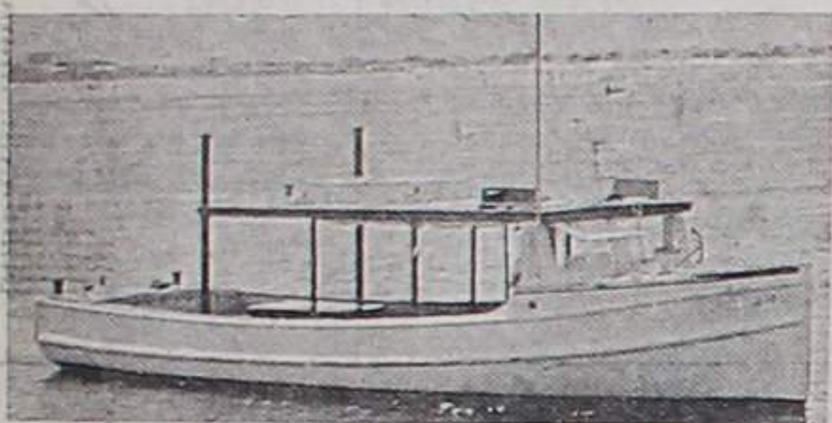
The Ric Roc, 40-Ft. Party Boat