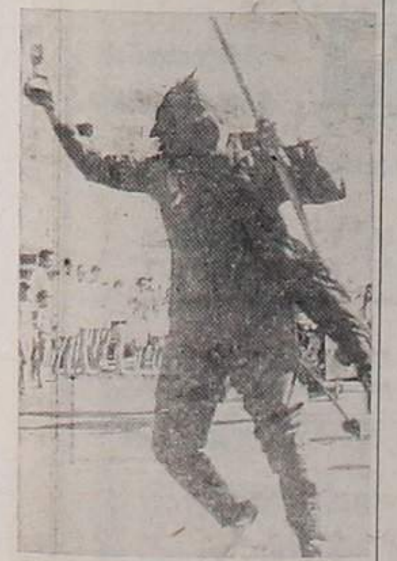
THE DEVIL was a prominent figure during the Horribles Parade last Saturday afternoon.