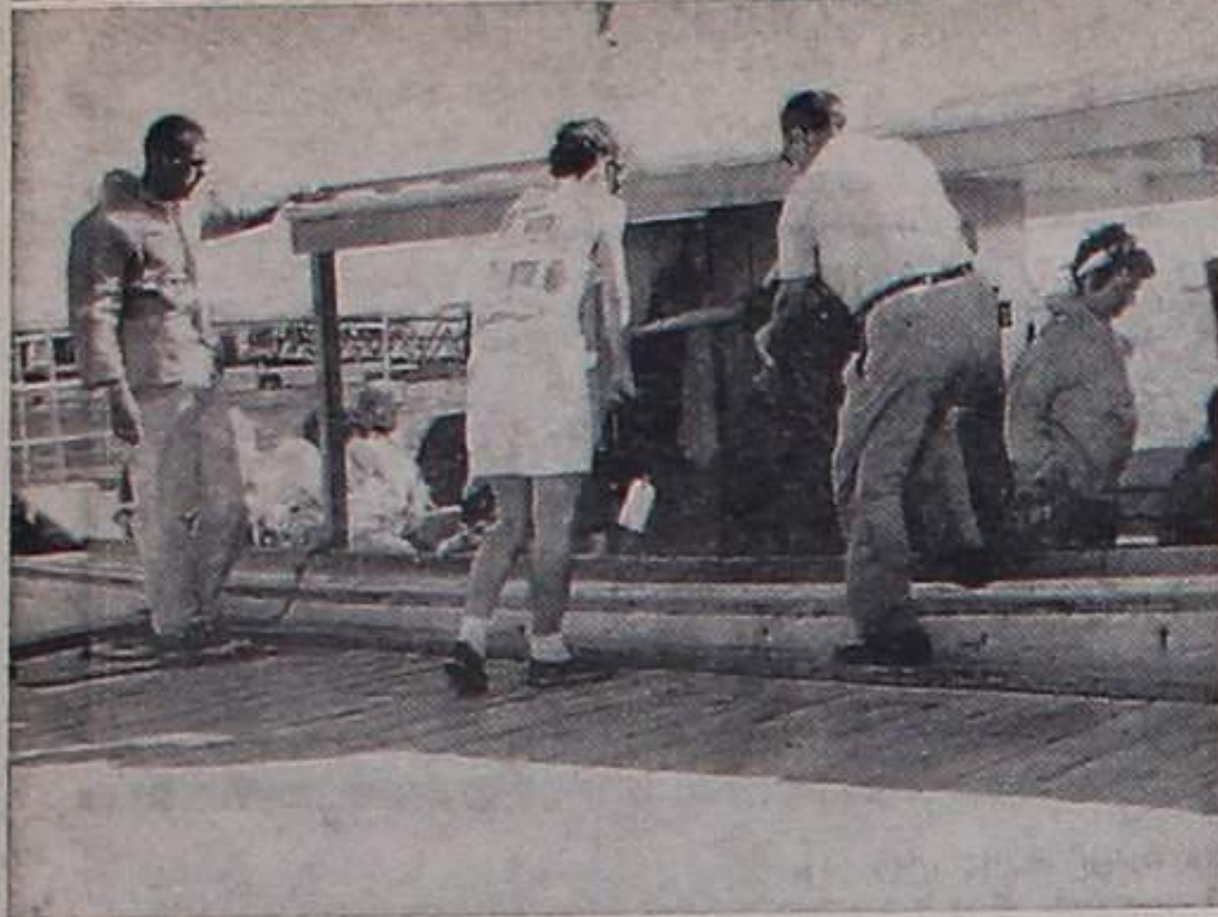
ALL ABOARD for boat trip were the words echoed by officials of the John Hancock FCA Outing last Saturday. Group of employees and members of their families is shown boarding Smith and Gilmore craft for brief tour of area.