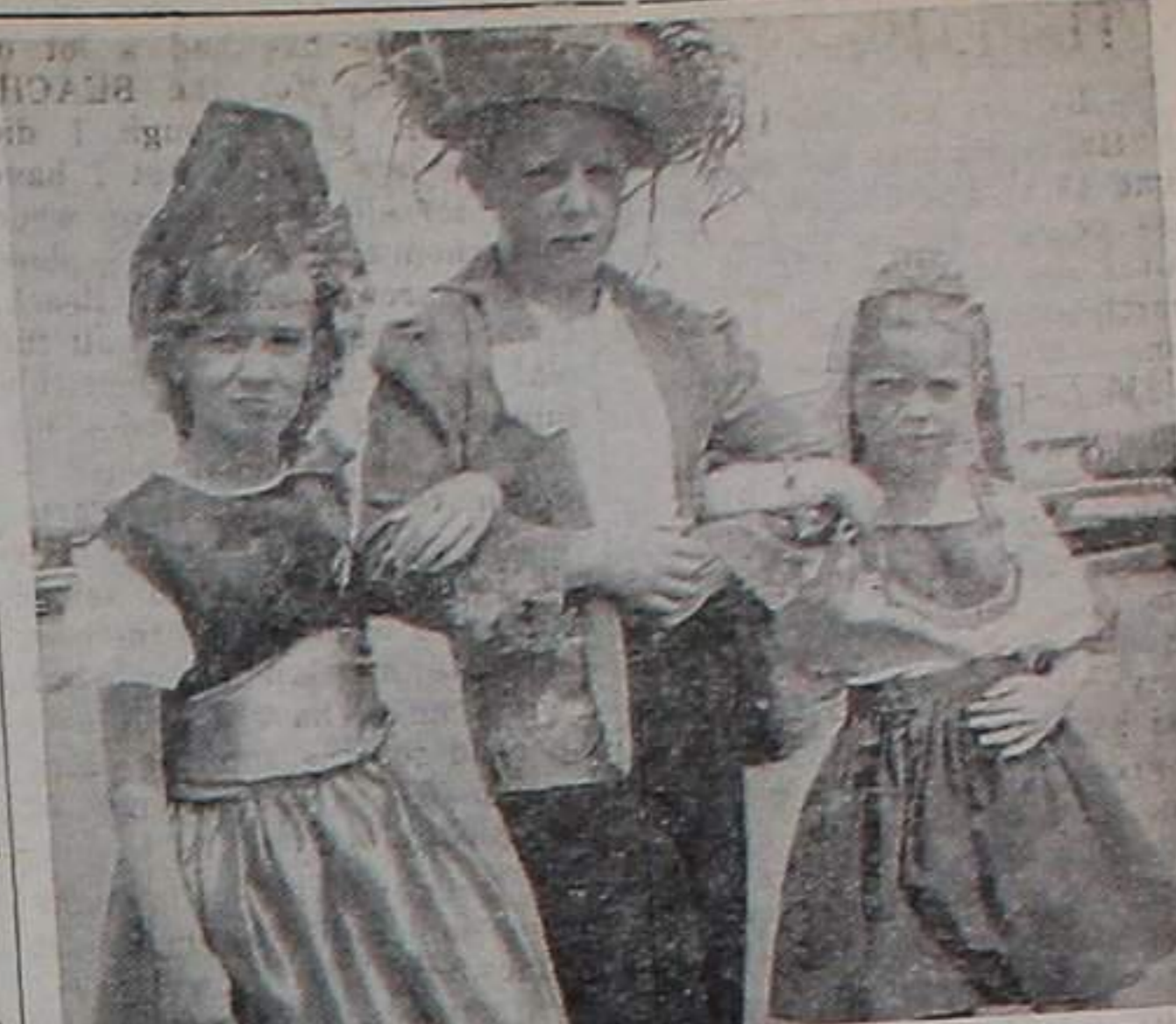
CHILDREN'S DAY PARADE participants are pictured above. One of the many characterizations manufactured by children who participated in the parade is shown. Children competed for top prize awards.

RECORD HOP Wednesdays from 2-4 p.m. for young teenagers; Thursday evenings for older teens. Both at Casino Ballroom. See the separate schedule of special weekly events each week elsewhere in the BEACHCOMBER. A complete schedule of summer events may be obtained for asking at the chamber of commerce office in the Sea Shell.