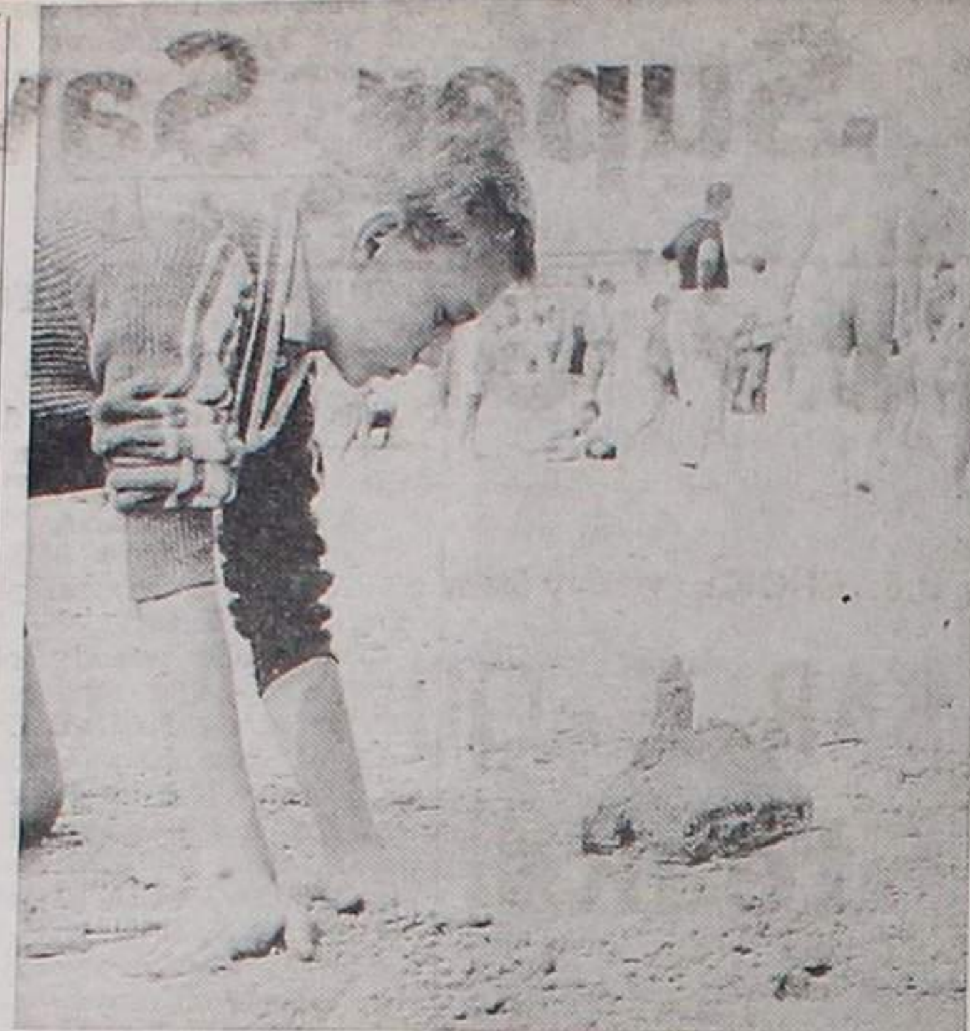
FINISHING TOUCHES follows close inspection by this amateur builder who competed in the Most Religious category during the Sand Castle Contest last week. Miniature replica of a church is shown.

Visit Our Wax Wheel Shop for Unusual Gifts!