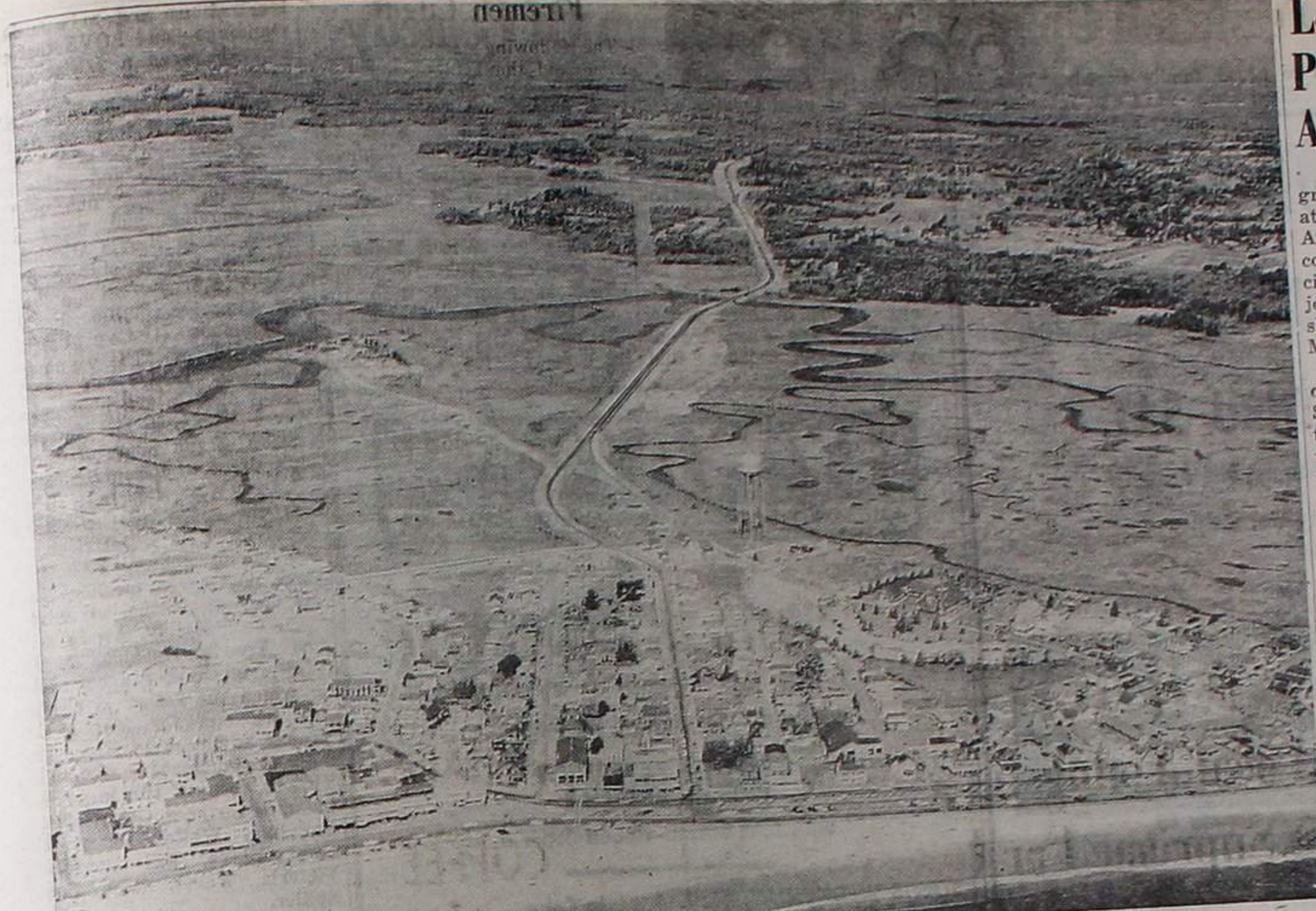
SUMMER TOURIST TRAFFIC to New Hampshire's Seacoast region has been benefiting for nearly a month by the opening of all eight miles of the new Exeter-Hampton expressway. Aerial photo shows eastern end of the 8-mile highway as it crosses the marshes behind the Hampton Beach water front to head westerly to its interchange with U. S. 1 and the N. H. Turnpike then join Route 101 by-pass in Exeter. This section of the expressway from Hampton Beach to U. S. Route 1 was built by the State Highway department's maintenance division forces under local agent Earl Spear of North Hampton. Entire eight miles of new highway cost $4 million.

BAR-B-QUE CHICKENS 3 lb. avg. Hot All Day Long Home Made Pork Pies 29c 3 for 85c Birthday Cakes Made To Order Extra Birthday Cakes On Hand At All Times No Waiting Special Rolls of All Kinds Made To Order SATURDAYS — Home Baked Beans, Honey Brown Bread WHITE BREAD - CHEESE BREAD 100% WHOLE WHEAT BREAD HARD ROLLS - FRENCH BREAD - OATMEAL BREAD Cinnamon Bread and Raisin Bread Sea Tern Bakery 377 Ocean Blvd. WA 6-9186 Hampton Beach