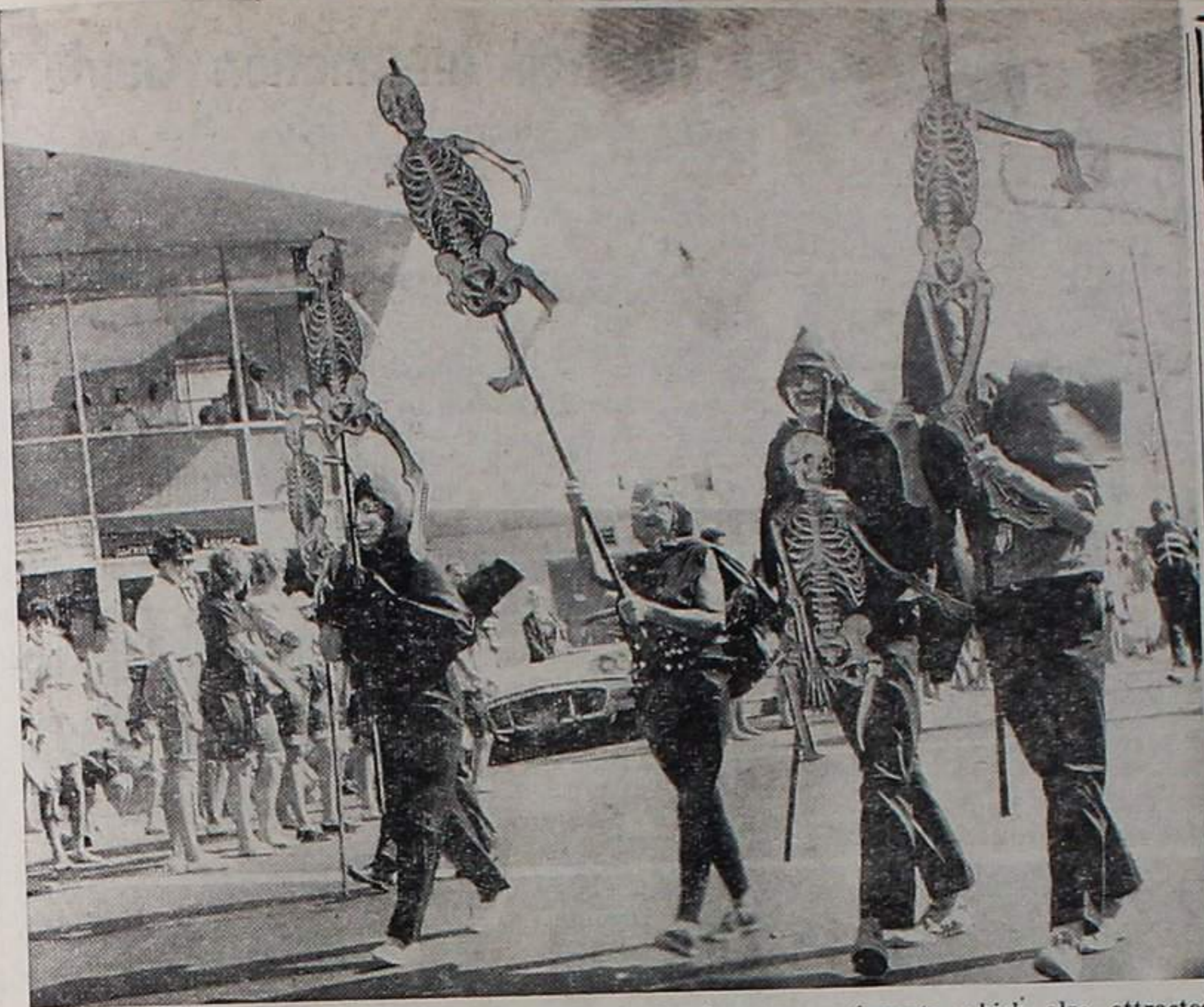
BEWARE OF THE J STREET GANG. One of the largest contingents which also attracted much attention in the parade is shown above. A tired in skeleton outfits, the above shot is just a small segment of the over all J street unit.