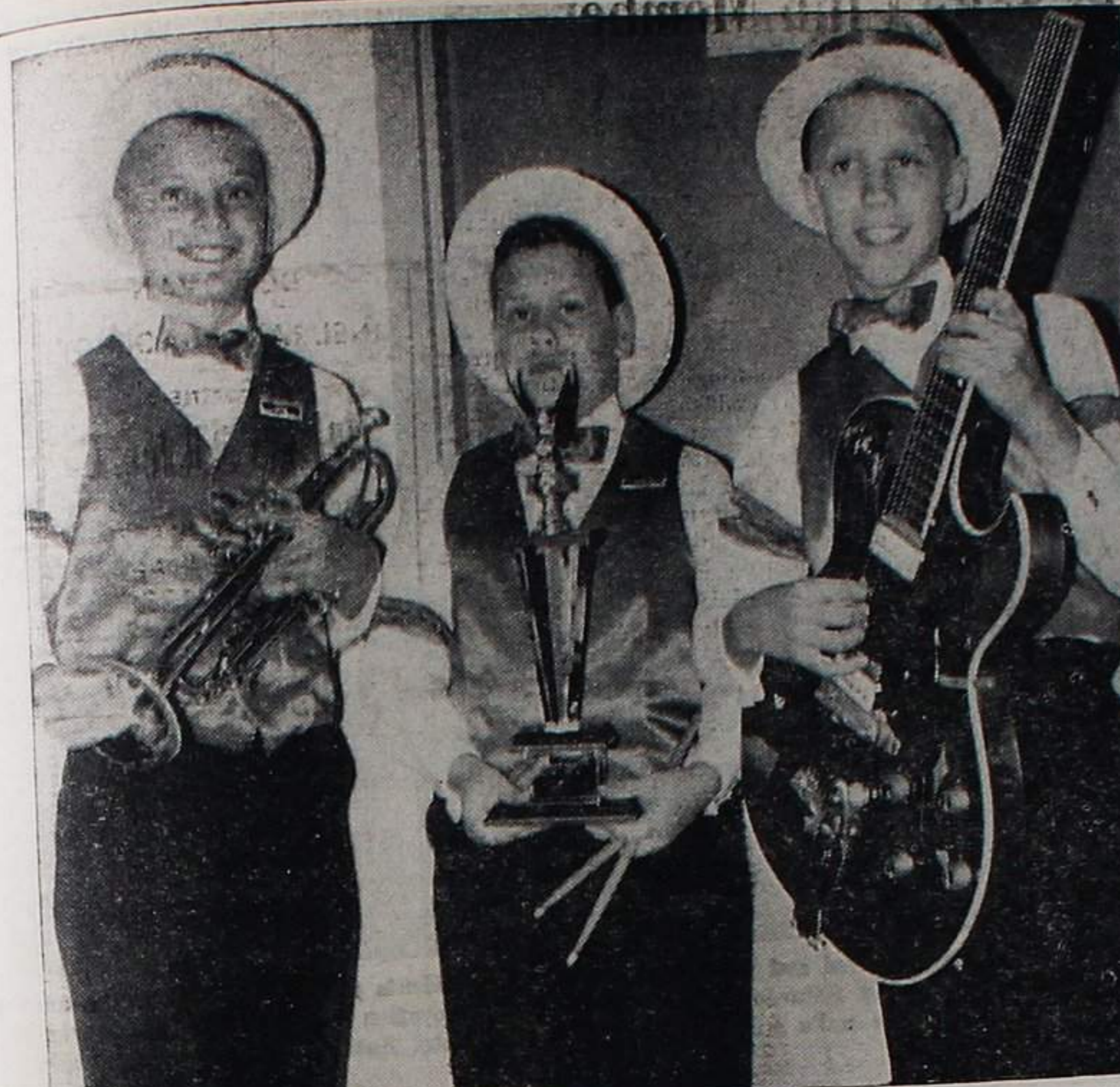
THE MUSIC MAKERS from Ayer, Mass. walked off with top honors in the grand finals of the 1963 Junior Division talent competition this week. Pictured following their victory over the other winners of the weekly competition Monday evening is the instrumentalist trio who played guitar, drums and trumpet.