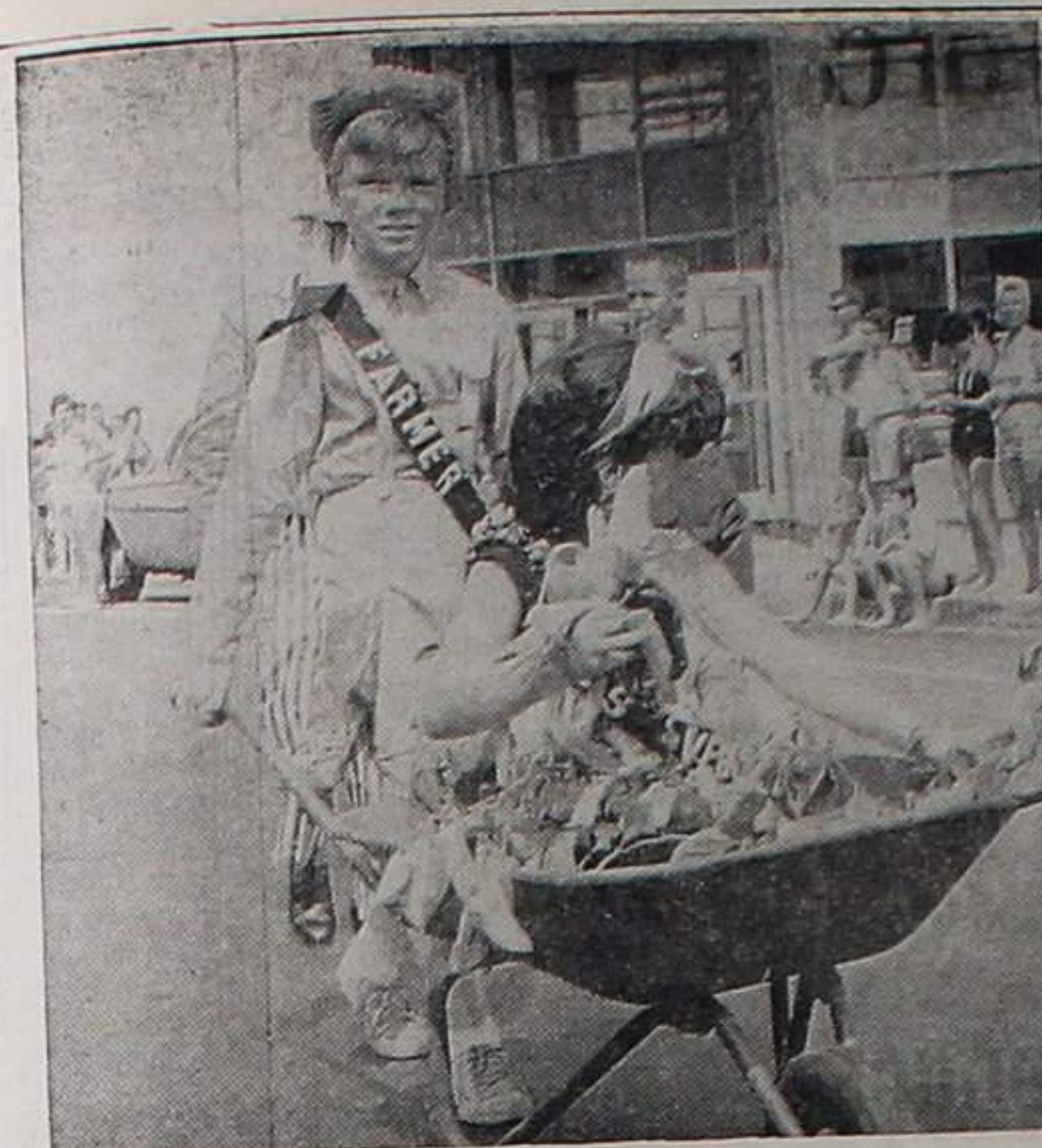
TYPICAL CHILDREN'S DAY scene last week during the traditional parade is shown above. Youngsters were also judged in several categories in competition for prizes which were awarded later.