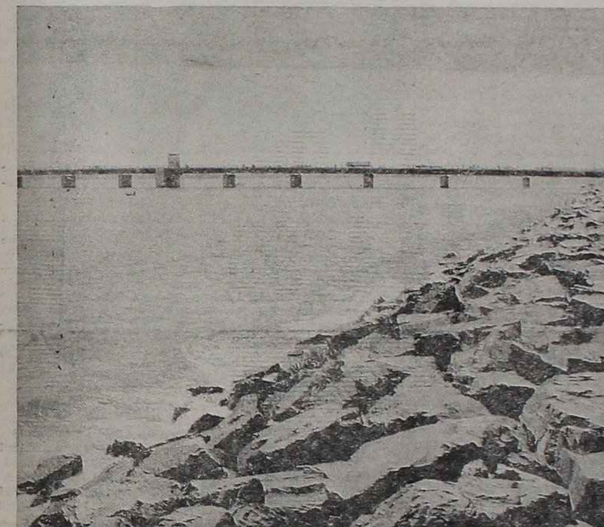
SITE OF NEW HARBOR WORK to be undertaken at Hampton Beach is shown in the shot of the Hampton Harbor mouth looking towards the bridge. Gov. John King recently signed into law a bill which will find major improvements being undertaken in both Hampton and Seabrook Harbors by dredging and constructing jetties together with the renourishment of Hampton Beach proper with sand.

Several years of cooperative planning and work on the part of local area citizens, state legislators, town, state, and beach officials together with the aid of the Federal government were climaxed late last week as Gov. John King signed the bill which will better Hampton and Seabrook Harbors and the sands of Hampton Beach.