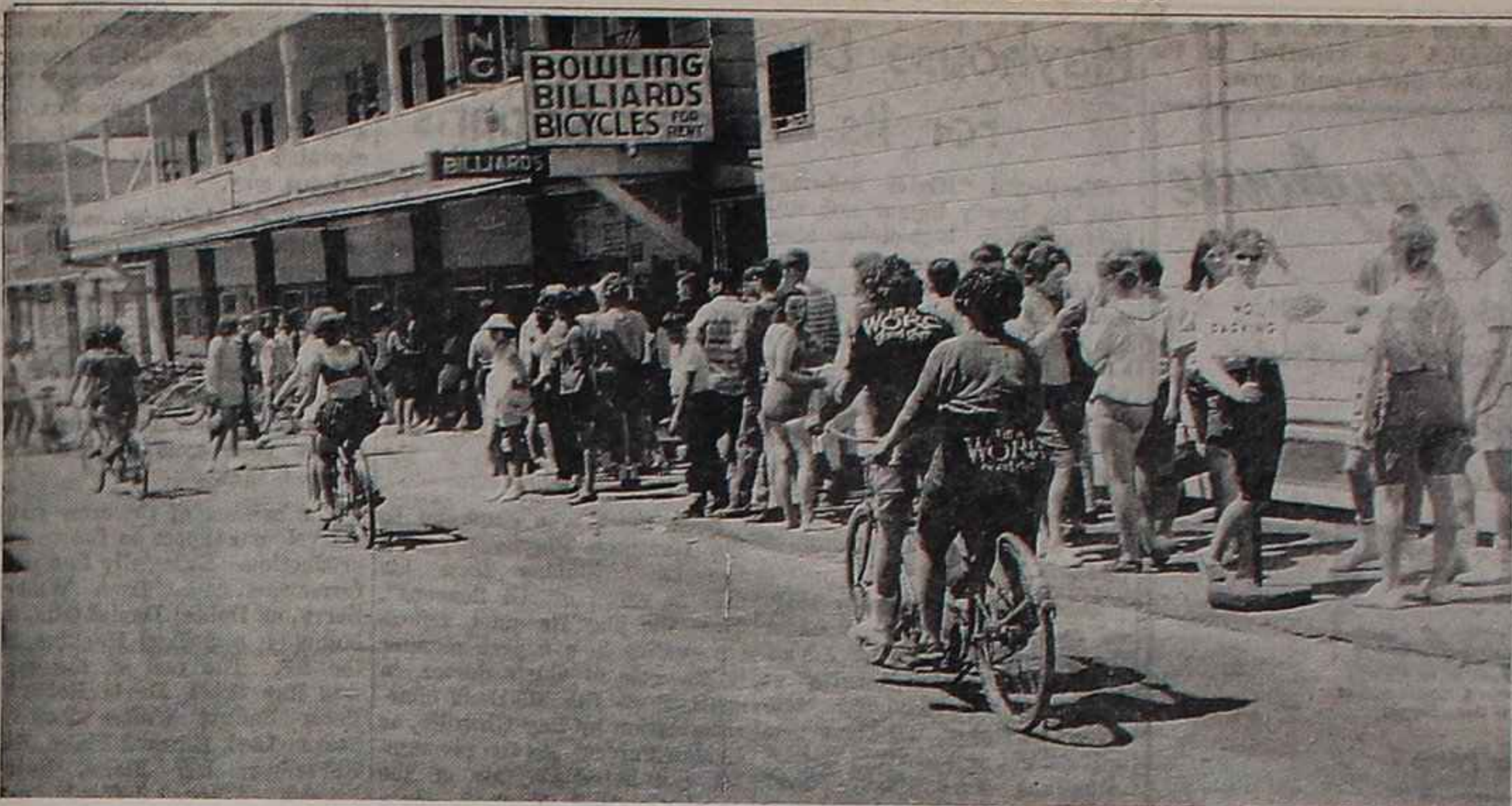
WHEN DO I GET A TURN? Hundreds of CYO youth from the Worcester, Mass. diocese on an outing at Hampton Beach last week waited hours in line at many beach establishments for enjoyment and pleasure. Shown above are a group of the youngsters who are awaiting their turns for bicycles at the Ferncroft Recreation center.

WHITE BREAD - CHEESE BREAD 100% WHOLE WHEAT BREAD HARD ROLLS - FRENCH BREAD - OATMEAL BREAD Cinnamon Bread and Raisin Bread Sea Tern Bakery 377 Ocean Blvd. WA 6-9186 Hampton Beach