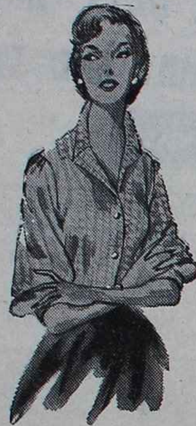
Women's Tailored Shirt