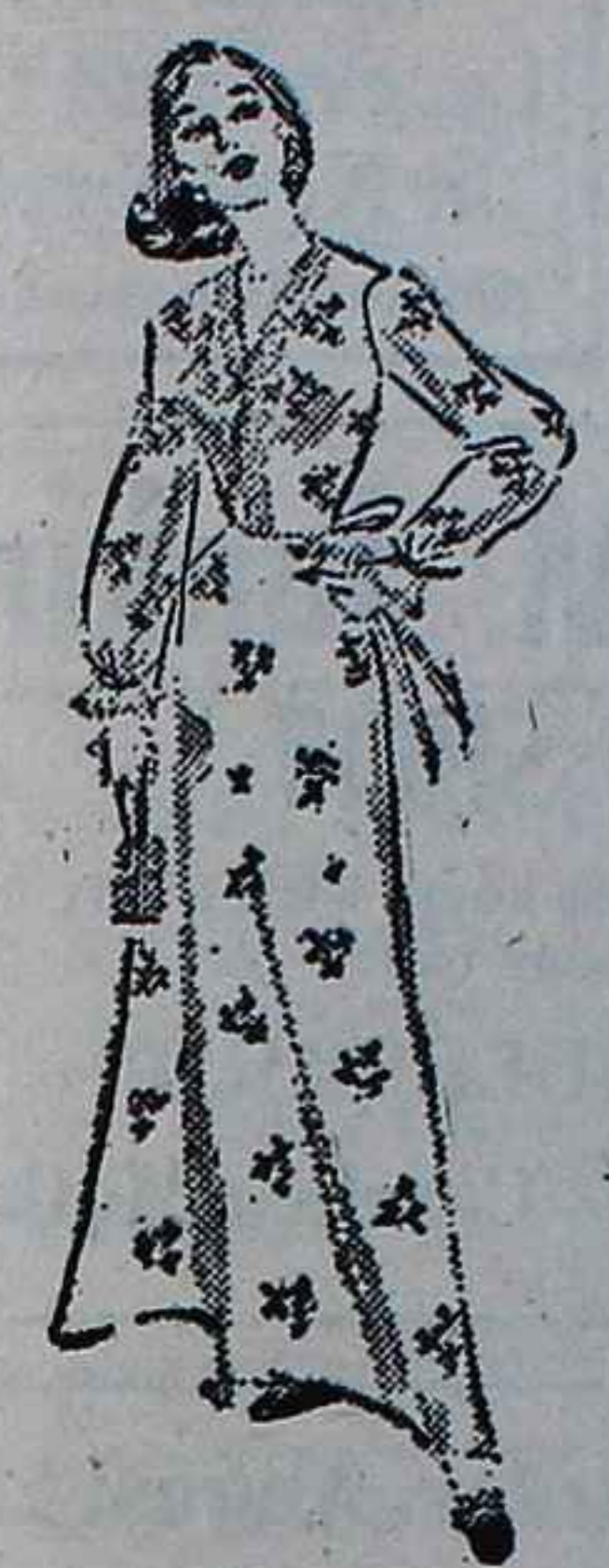
CHALLIS GOWNS $6.95

Gowns by Artemis. True luxury designs with delicate touches of lace in this prized no-care fabric. Floral prints on white or blue background. Sizes 34 to 40.