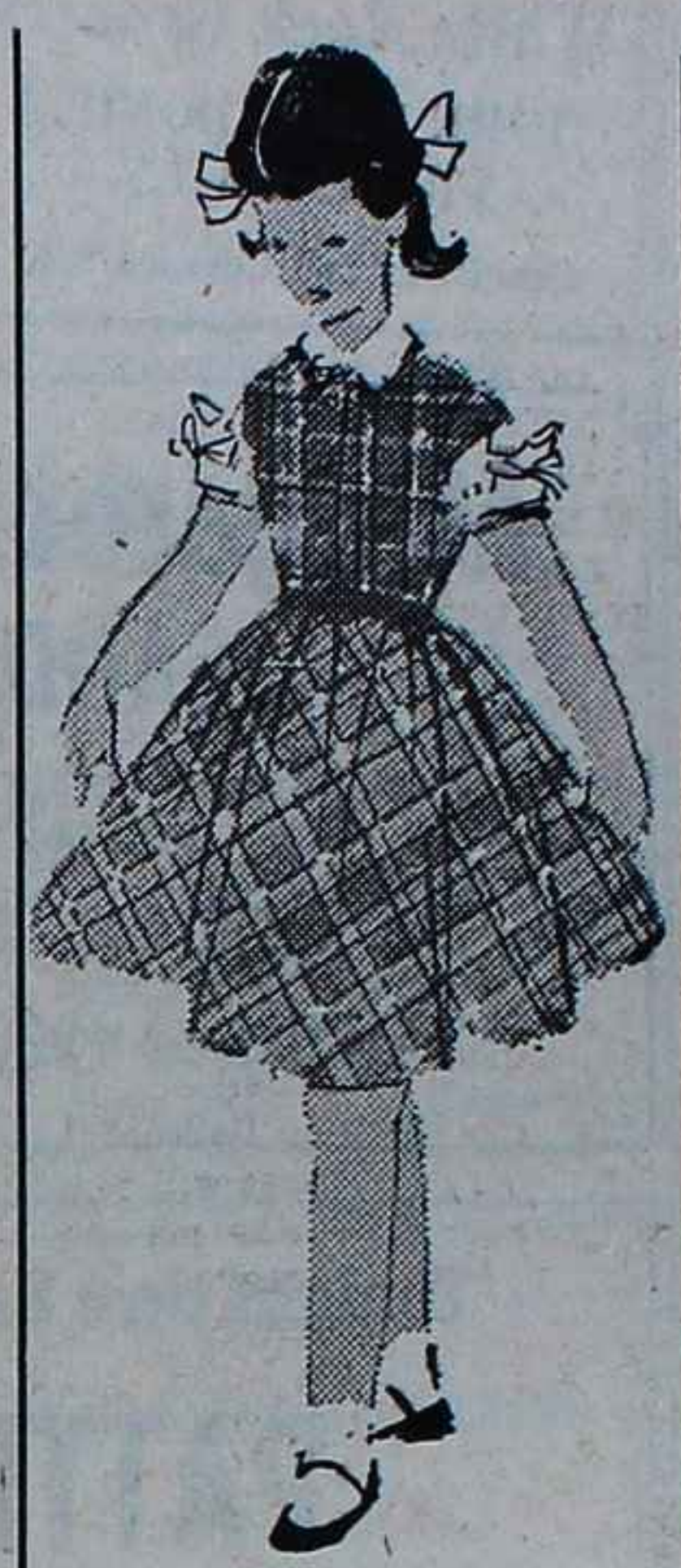
Kate Greenaway's Beguiling

Gowns by Artemis. True luxury designs with delicate touches of lace in this prized no-care fabric. Floral prints on white or blue background. Sizes 34 to 40.