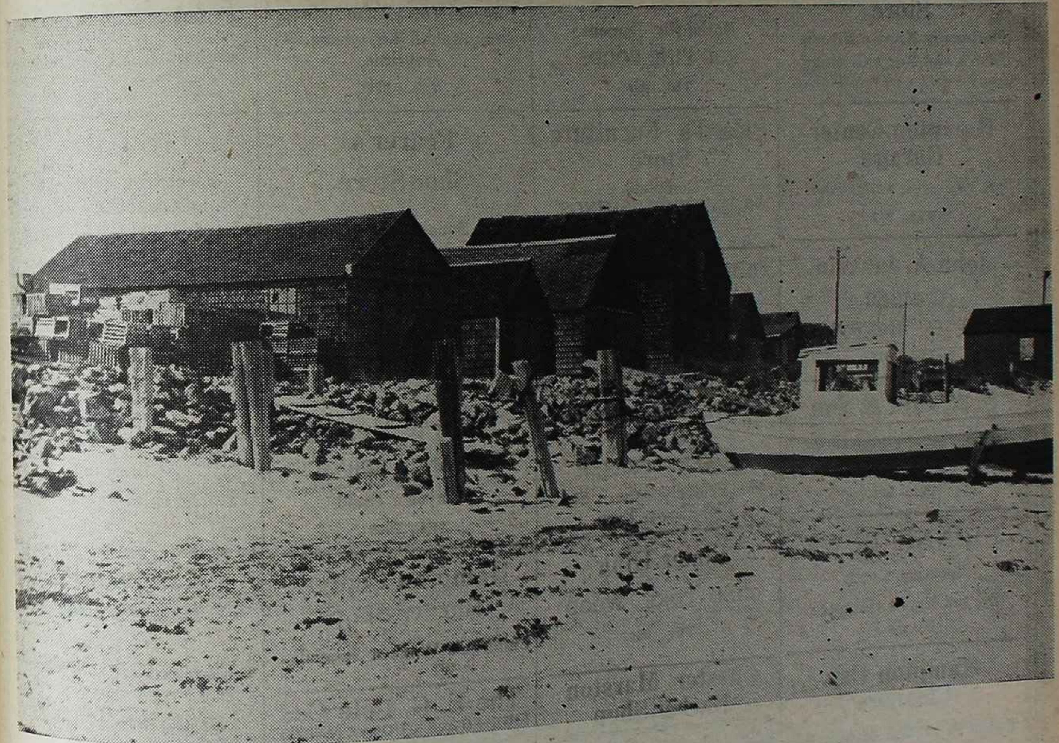
FISH HOUSES — NORTH BEACH