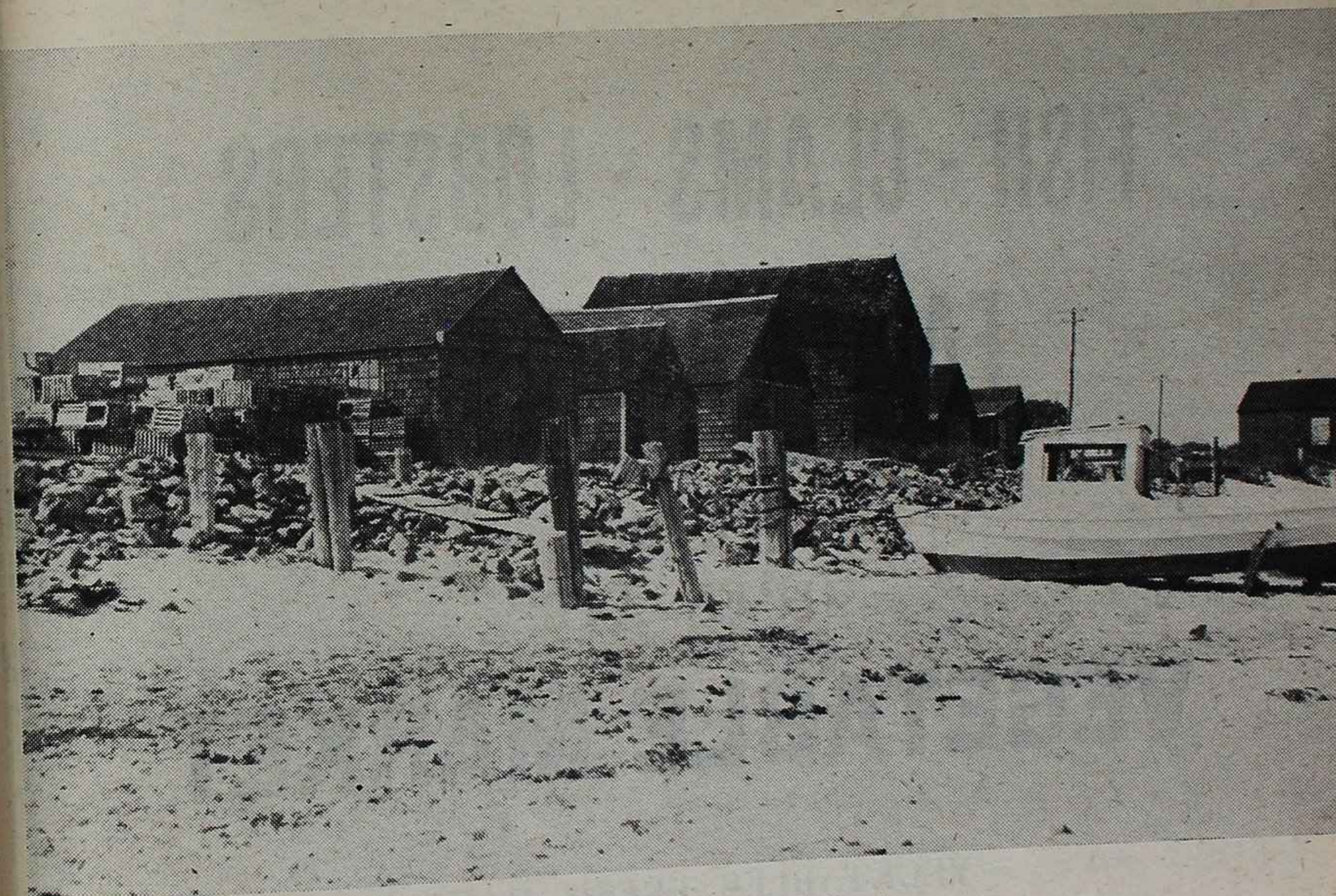
Scenic Fish Houses, North Beach