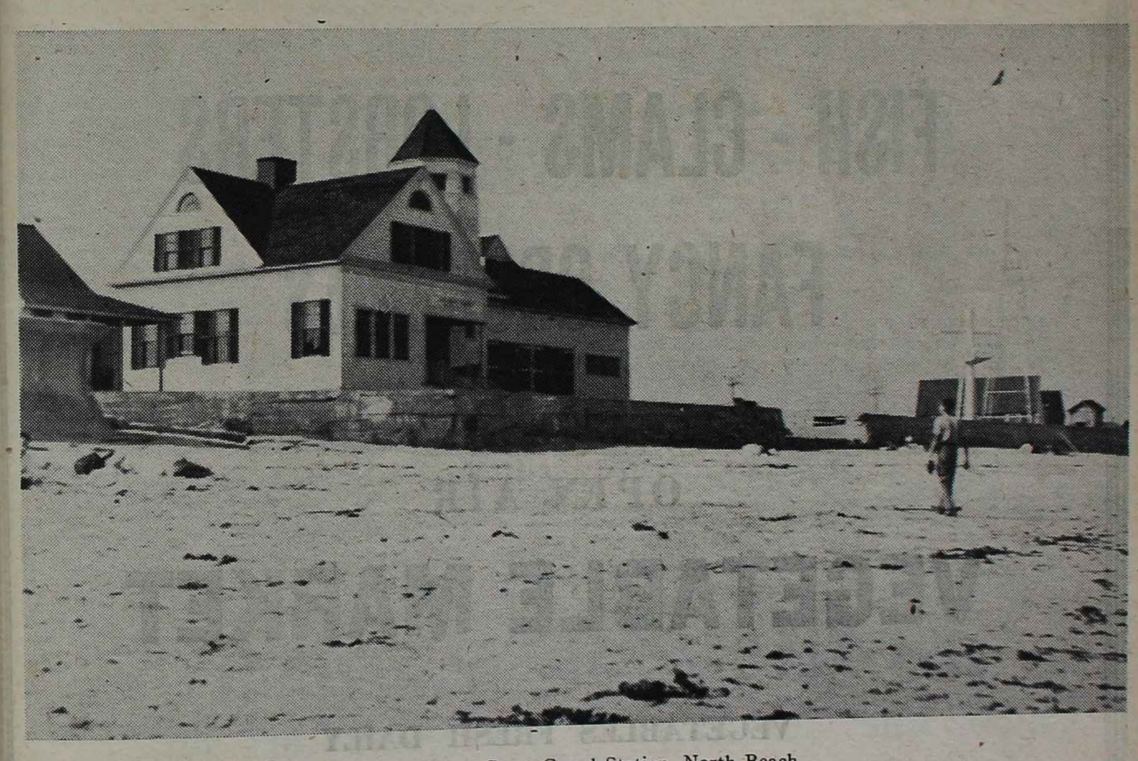
United States Coast Guard Station, North Beach