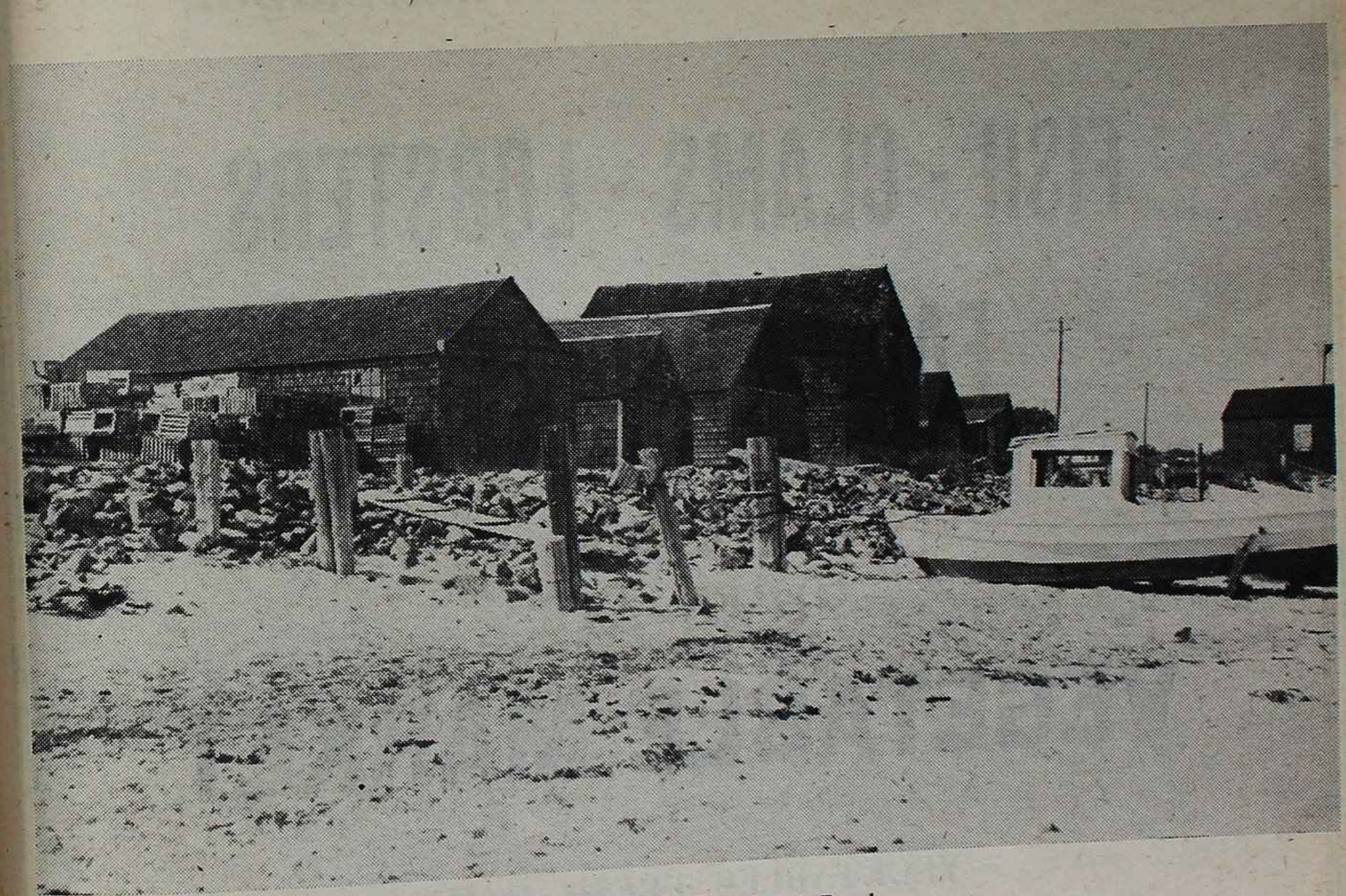
Scenic Fish Houses, North Beach