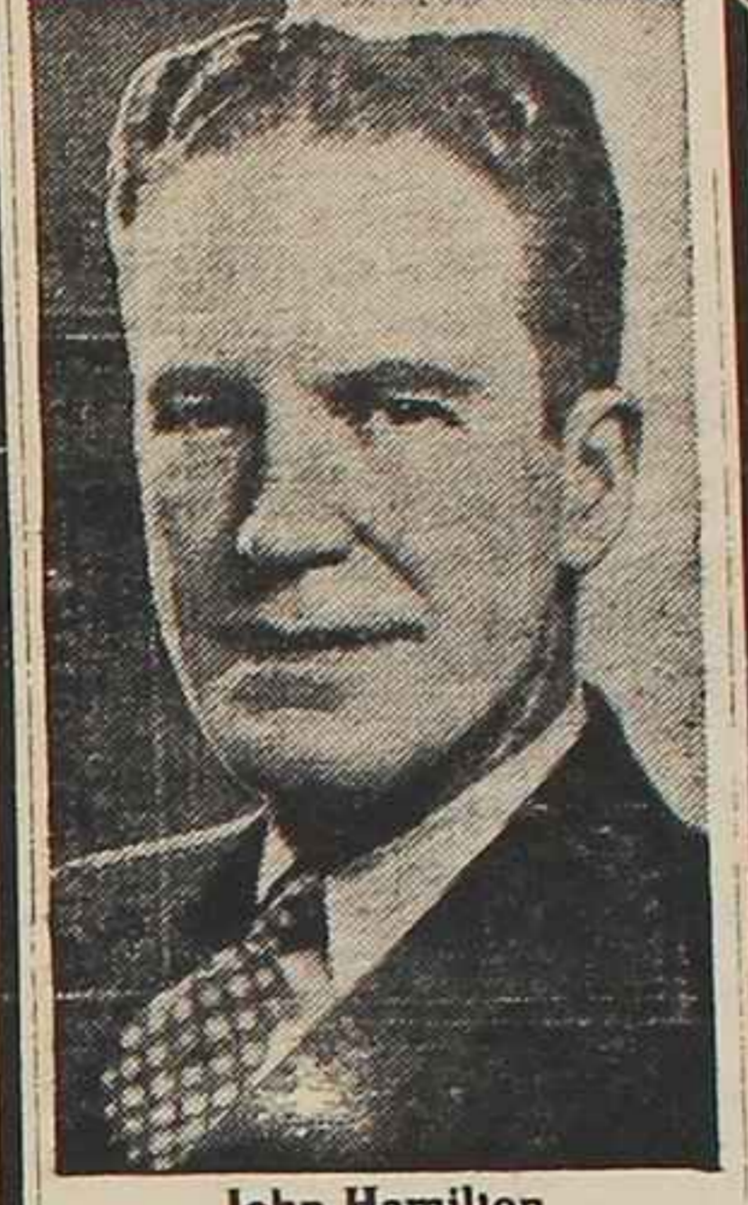
John Hamilton Republican National Chairman

OLYMPIA Theatre Hampton Beach Sunday August 23 BORIS KARLOFF "The Walking Dead" Selected Shorts Monday August 25 WILL ROGERS "The Connecticut Yankee" Selected Shorts Tuesday August 26 Robert Kent, Gloria Stuart "THE CRIME OF DR. FORBES" News Shorts Wed., Thur. Aug. 26, 27 LORETTA YOUNG FRANCHOT TONE "The Unguarded Hour" Selected Shorts Fri., Sat. Aug. 28, 29 RICARDO CORTEZ PATRICIA ELLIS "Postal Inspector" News Shorts